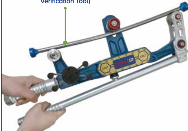
CVT (Calibration Verification Tool)

Specifications assume COLT used on a wire rope with a fixed and flexible end